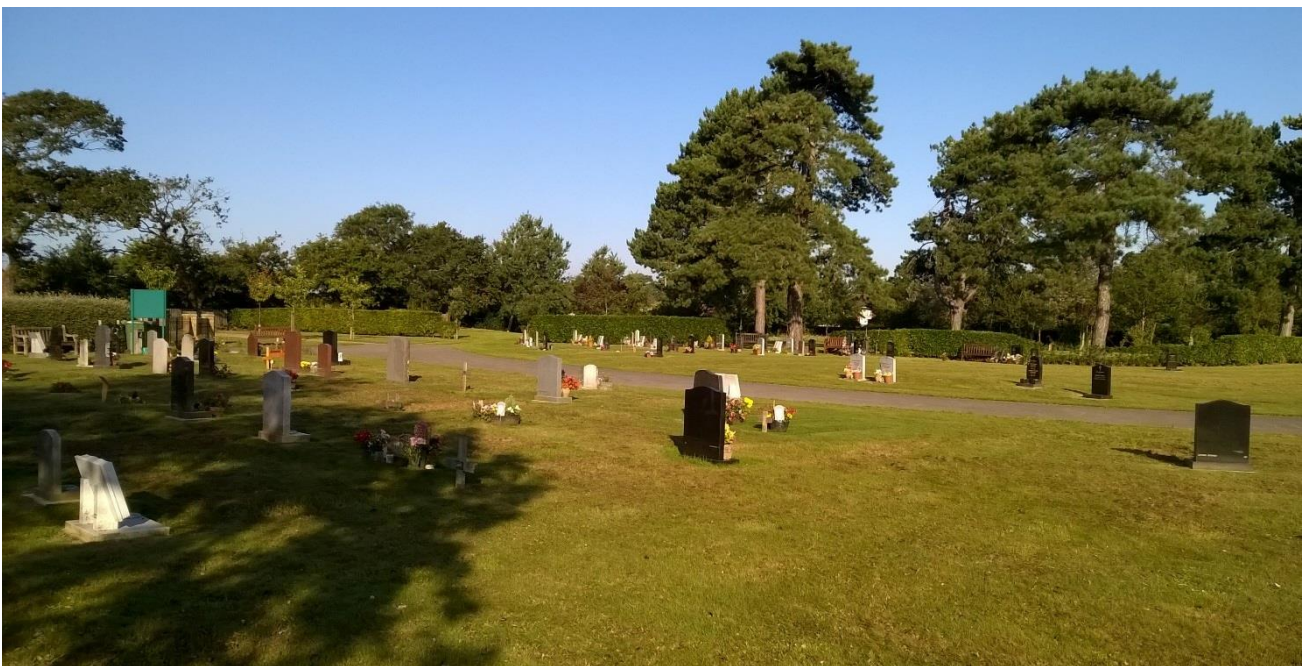
Milford Road Cemetery. An example of an NFDC Cemeteries Lawn Section.

Flower vases must be an integral part of the memorial or, if removable, must be placed no more than 15 inches (380mm) in front of the authorised memorial headstone base (See 11.1.1).