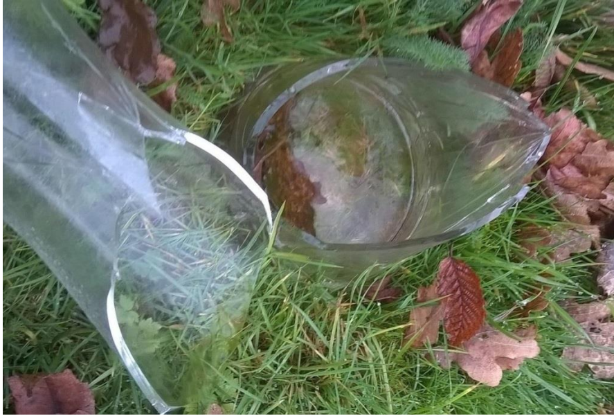
An example of unauthorised, hazardous memorabilia